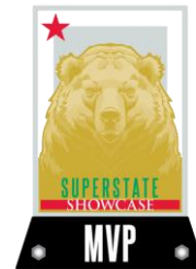
MVP each division