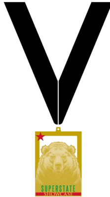
Custom Medal 1-4 th