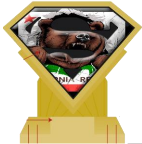
Custom 1 st Place Resin