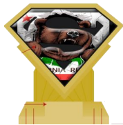
SS Showcase Trophy +